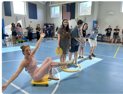
Our Teachers, New and Veteran participated in team building - A great way to get to know each other!