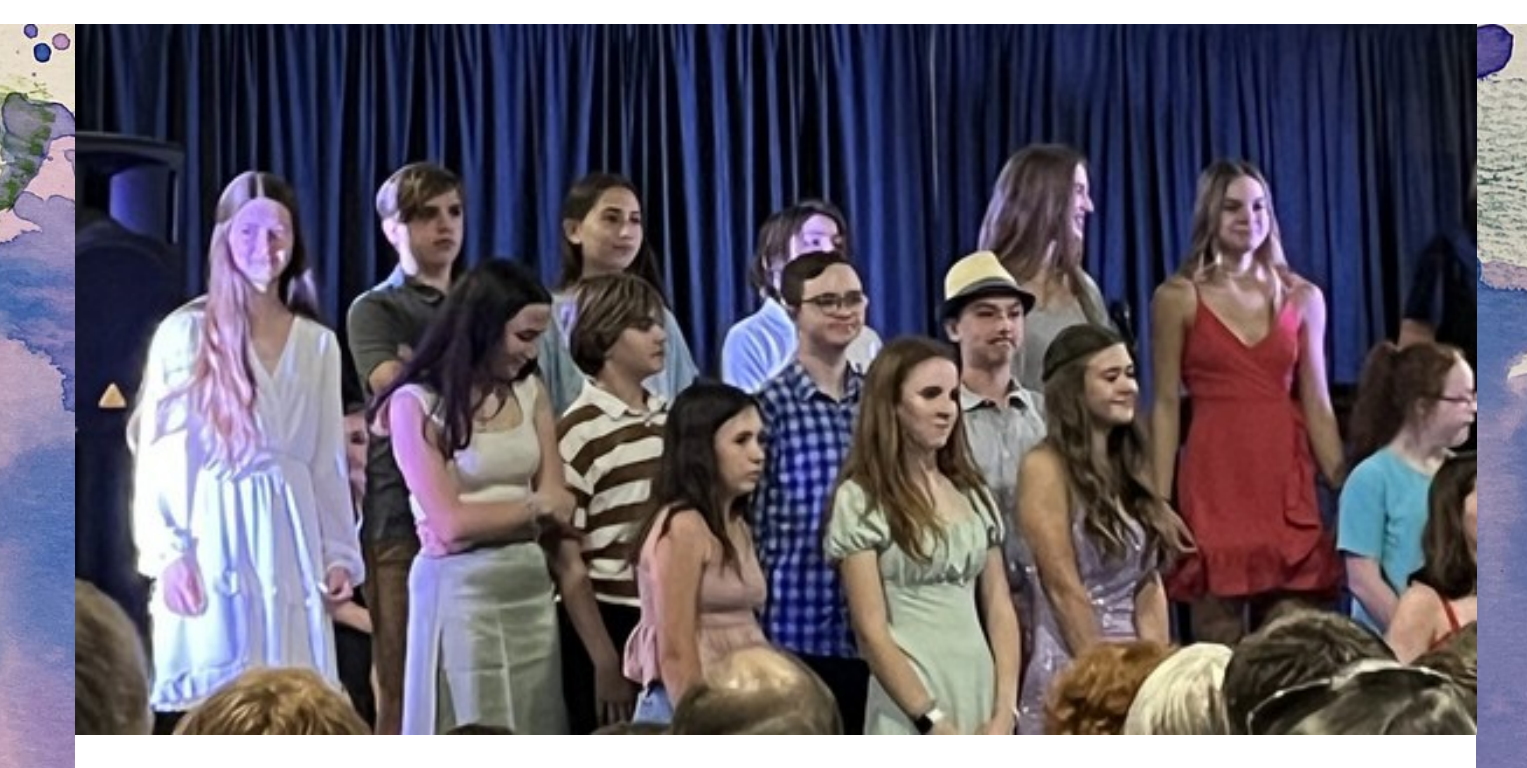
So long but not good-bye to some of our favorite 8th graders of all time!