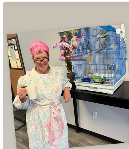
Just Some Morning Coffee, Rollers and a Robe...Nothing Unusual Here!