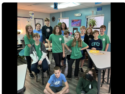
6th Grade Shares the CFCI Spirit! Wearing CFCI Gear Brings Us Together in a Positive Way!