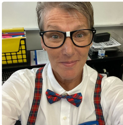
A True Mathlete!