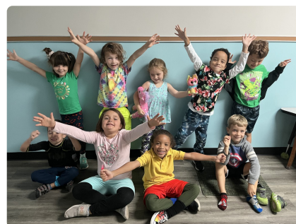
Pajama Day is a Cozy Day for Reading, Learning and Being Friends!

STRATEGIC PLAN SURVEY - CLICK HERE TO PROVIDE INPUT