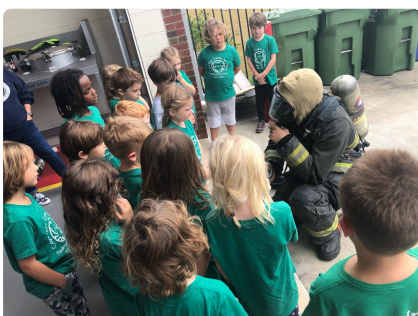
Hands-on and In-person Learning